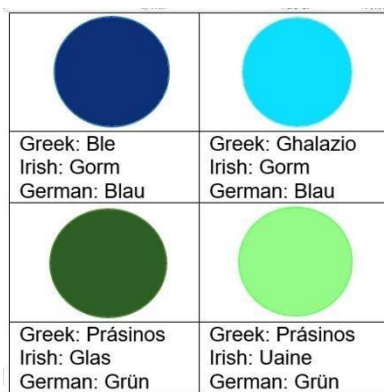
Figure 1. Colour terms in Greek, Irish, and German.

During this experiment the stimuli presented in Figure 1 and Figure 2 are used to assess the participants' perception of the presented colours. As described earlier, Greek has two terms for blue, namely ble for darker blue and ghalazio for a lighter blue. Irish has two terms for green, namely glas for natural (darker) green and uaine for artificial (lighter) green. German only has one term for both categories, namely blau for all shades of blue and grün for all shades of green. The colour classification of the colours blue and green can be seen in Figure 1. The colours used in this experiment will be #6FDEFF for light blue, #0D3078 for dark blue, #94FB86 for light (artificial) green and #2D5F26 for dark (natural) green. For the measurement of brain responses, an ERP set-up is used.